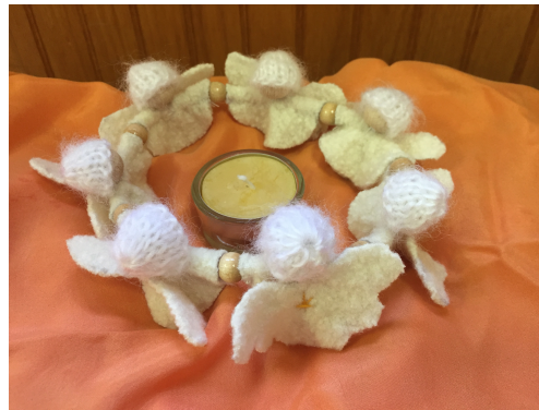
Grades 2 and 3 Handwork gifts from Germany via Viola: