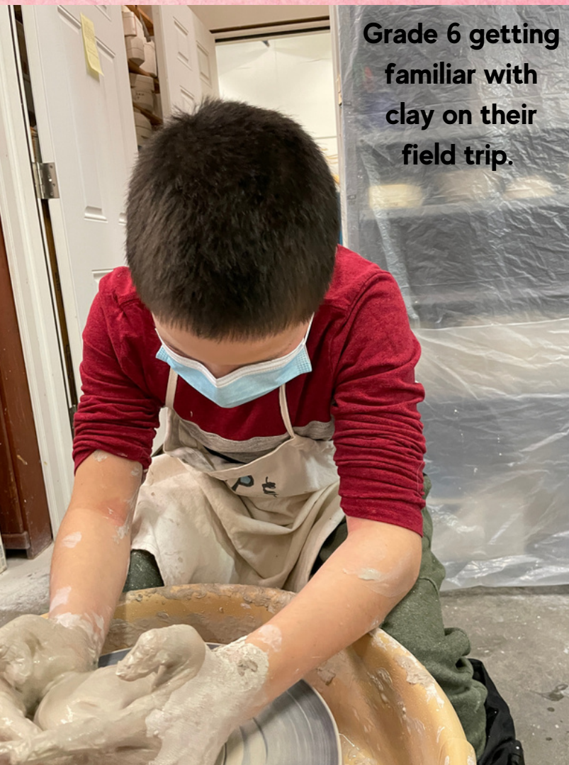
Grade 6 getting familiar with clay on their field trip.