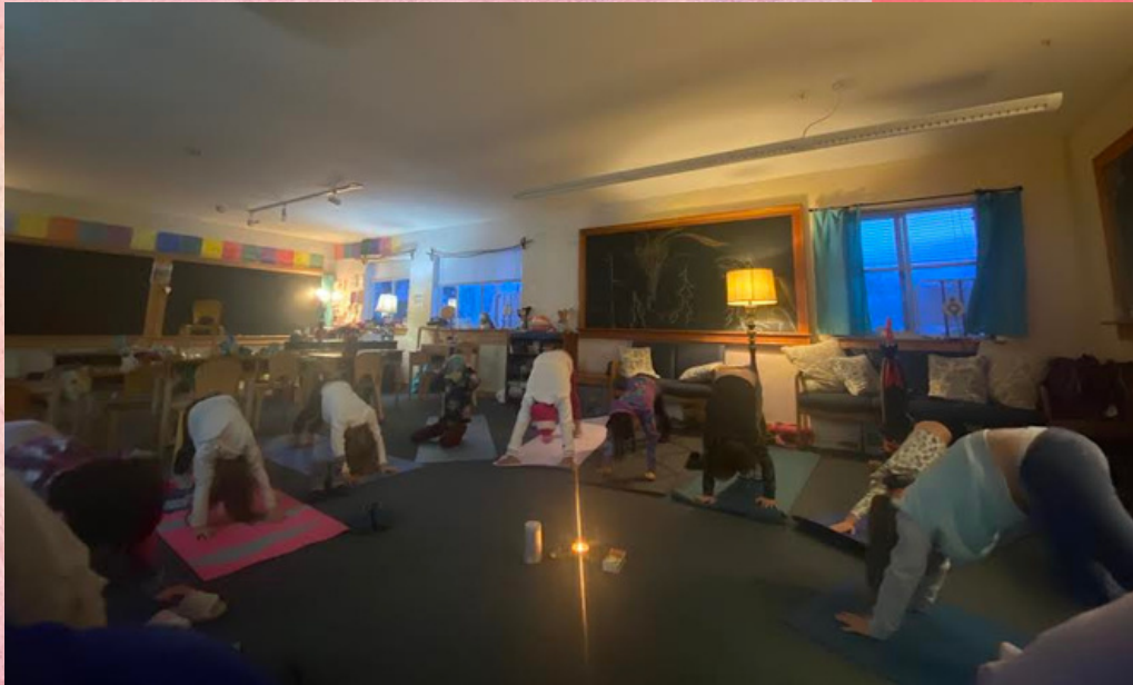
morning yoga with grade 2/3