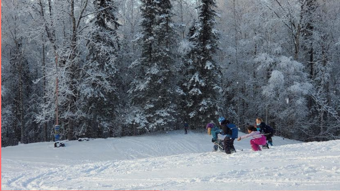
Skiing at Russian Jack