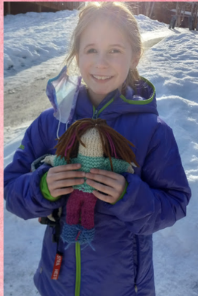
Some of our Happy Knitters and their wonderful Gnome creations!