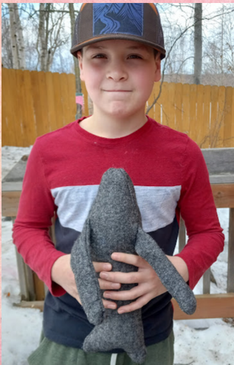
6th Graders are hand stitching stuffed animals this semester.