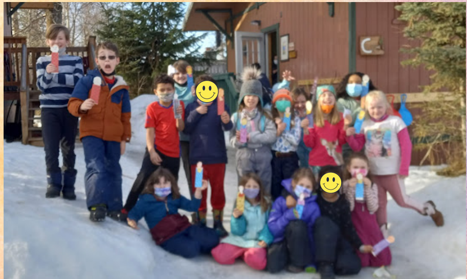
The 2nd and 3rd Graders made bookmarks and origami dolls for Doll's Day.