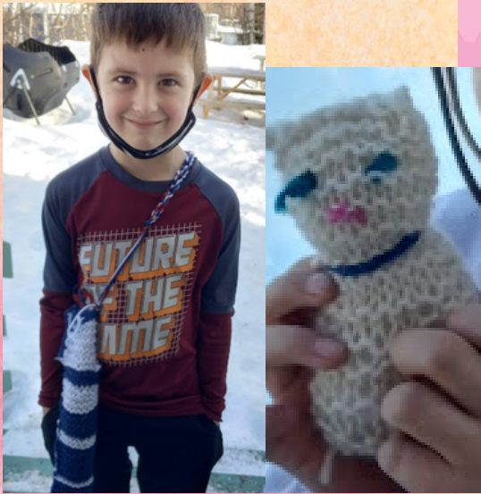
The first graders are moving right along with their knitting projects!