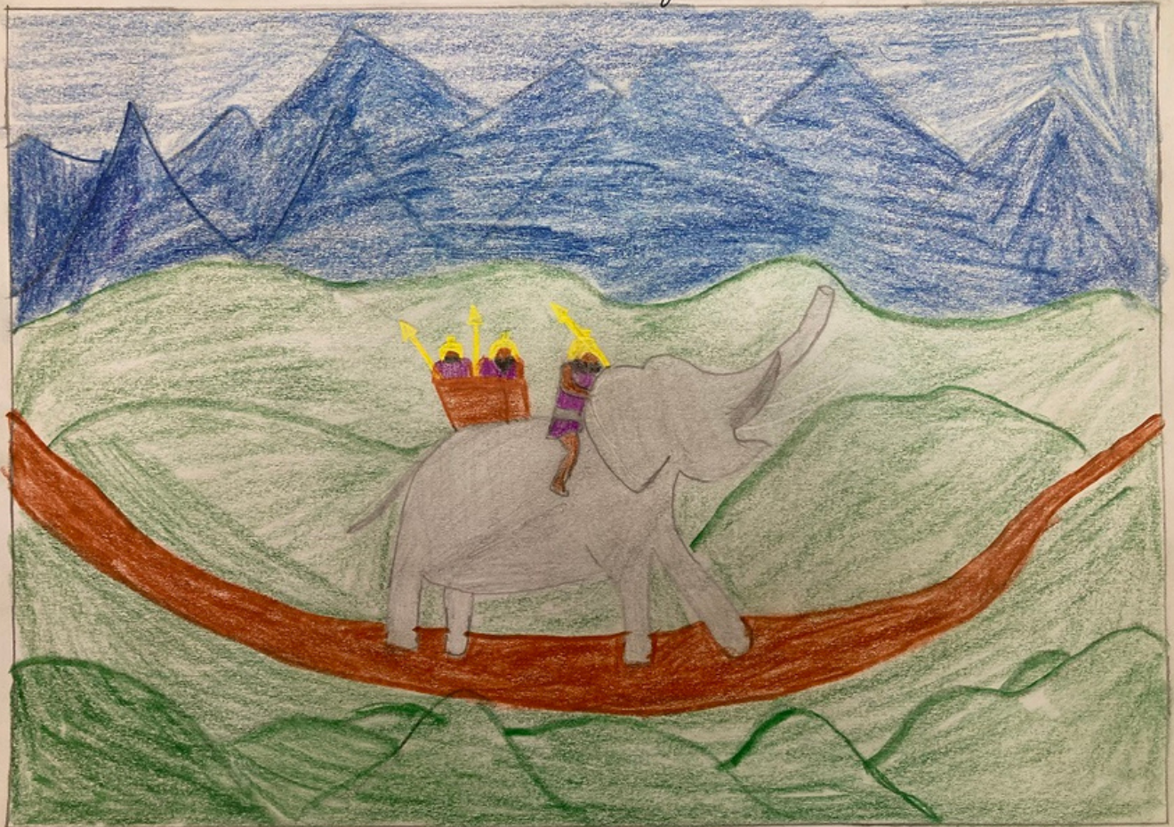
Hannibal Crossing the Alps

After a long time of on and off fights with Rome and Hannibal they finally made a peace treaty between them and it lasted pretty long until Hannibal broke it. And Carthage tried to fight Rome, but Rome ended up defeating and lowering down Carthage.